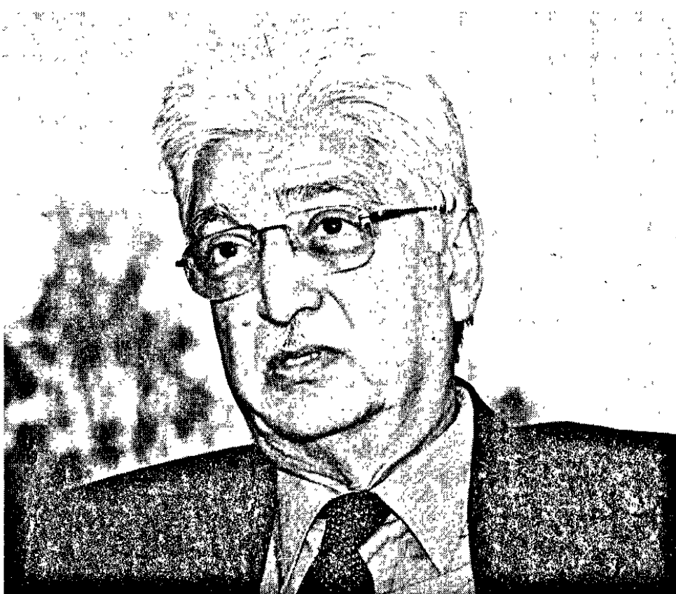
Premji's foundation focuses on elementary education in rural areas

appointment soon for a detailed presentation by Premji and his team on the foundation's plan for the state.