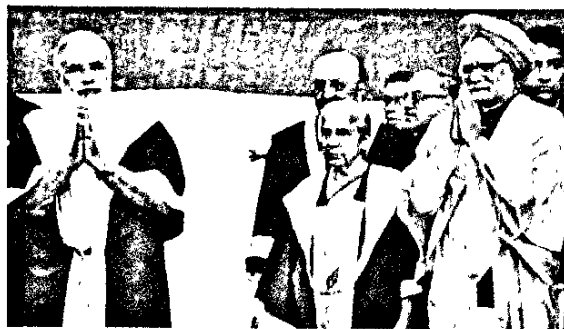
Gujarat Chief Minister Narendra Modi (left) along with Governor Kamla Beniwal and Prime Minister Manmohan Singh at IIM-A's 46th convocation.

The convocation saw Gujarat Governor Dr Kamla Beniwal and Chief Minister Narendra Modi sharing the dais with the Prime Minister. In his convocation address to the 46th passing-